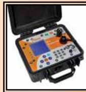
The INSPECTOR Data-logging