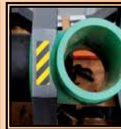
Top Clamp Short Elbows/Tee