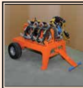
Trolley for machine body