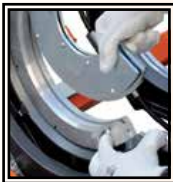
Inserts Ø 75 ÷ 225 mm