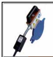
Heating plate with Digital Dragon